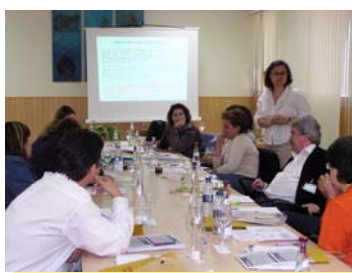
Working seminar First Workshop WP5-CAENTI (Huelva, 5th May2006)

Web page of the Conference: www.territoriale-intelligence.eu (Heading International Conferences and Huelva 2007).