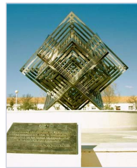
University of Huelva. Campus de El Carmen (2007)

The conference will last four days. The first of them will be devoted to an internal discussion among the members of the CAENTI Coordination Action. During the other days, the participation will be open to all the persons who will attend the conference and to the communicants. On the second day, the work will be organized in plenary sessions that will consist, in the morning in the presentation of three conferences by experts who have an international fame because of their works about the thematic on which the conference focuses and in the afternoon in the presentation and discussion of the main results of the different work orientations of the CAENTI project. On the third day, the selected communications will be presented and debated within thematic workshops. On the last day, the organization suggests to the participants to make a guided tour of the Minas de Rio Tinto in Huelva province.