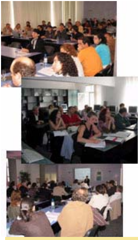
Exposiciones de la I Conferencia Anual Internacional de Alba Iulia (2006)

Good governance needs a kind of knowledge on the territory that generates global visions on the main problems that can affect the sustainable territorial development. Nevertheless, the scientific knowledge about the territory is a complex knowledge as it is difficult to identify and quantify causal links among lots of potential factors. Besides, it is an uncertain knowledge because of the scarce information, the measure errors and the undetermined results. Consequently, the knowledge about territory is usually ambiguous and different legitimate interpretations that are based on observations or valuations of similar data are used to coexisting.