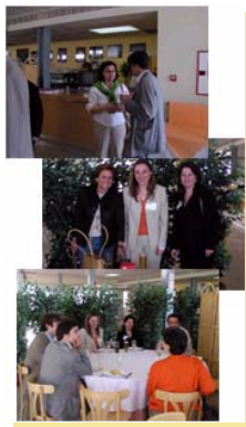
Friendship moment First Workshop WP5

The definitive texts of the authors who want to be published will be sent to the organization after the conference (deadline: November, 20 th 2007) so as the modifications that will be decided during exchanges and discussions could be made. The definitive texts will be submitted again to the Scientific Committee who will decide either the acceptance, or the acceptance under conditions or the publication rejection.