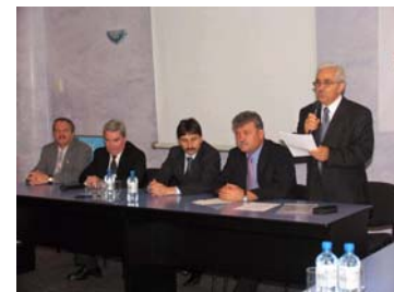
Inauguration of the International conference of Alba Iulia (2006)