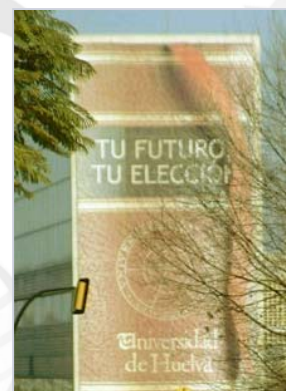
University of Huelva